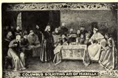
COLUMBUS SOLICITING AID OF ISABELLA